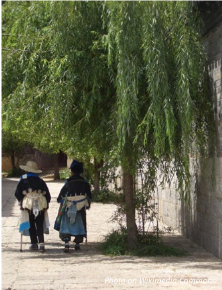
Naxi women in their traditional dress

Lijiang, nestled at the intersection of Yunnan, Sichuan, and Tibet, is the ancestral homeland of the Naxi people, with additional communities living across Sichuan and Tibet.