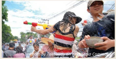
Water Splashing Festival

These groups have largely preserved their own languages, dress, and religious traditions, remaining far less assimilated into Han Chinese culture than their counterparts in China's interior. Inter-marriage, seasonal movement, and shared celebrations knit communities across national lines. The Dai Water Splashing Festival, for instance, is observed simultaneously in Yunnan, Thailand, and Laos.